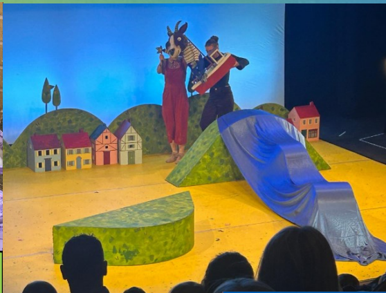
Y1 had the most amazing time watching The Smartest Giant in Town at Theatre Severn. The children enjoyed retelling the story and singing along. Their behaviour was impeccable!