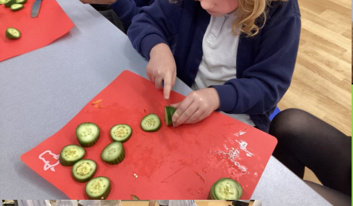
in Y3 the children have practised the skill of cutting, grating and slicing as part of a unit of work on making sandwiches.