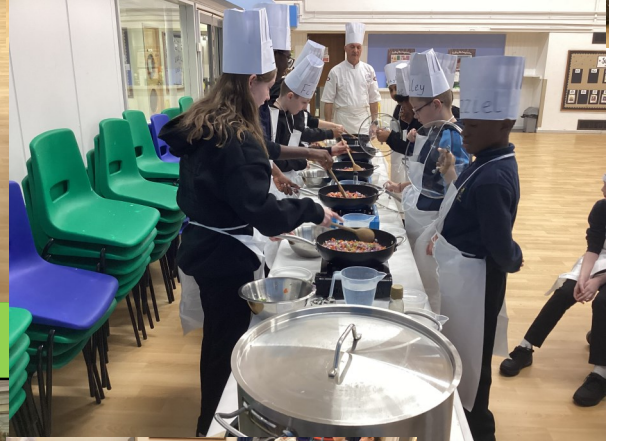
Y6 have been working with a Michelin starred chef this week and produced amazing, healthy cottage pies. They can now do this at home!