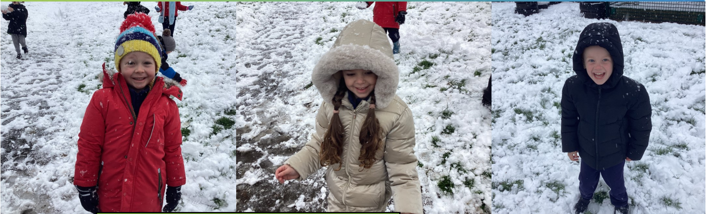
A selection of our snow pictures. Look at those faces!